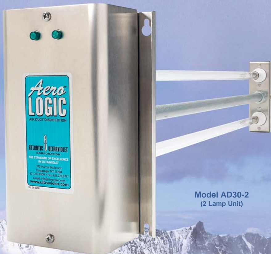
Model AD30-2 (2 Lamp Unit)

Annual lamp replacement and periodic cleaning is all that is required.